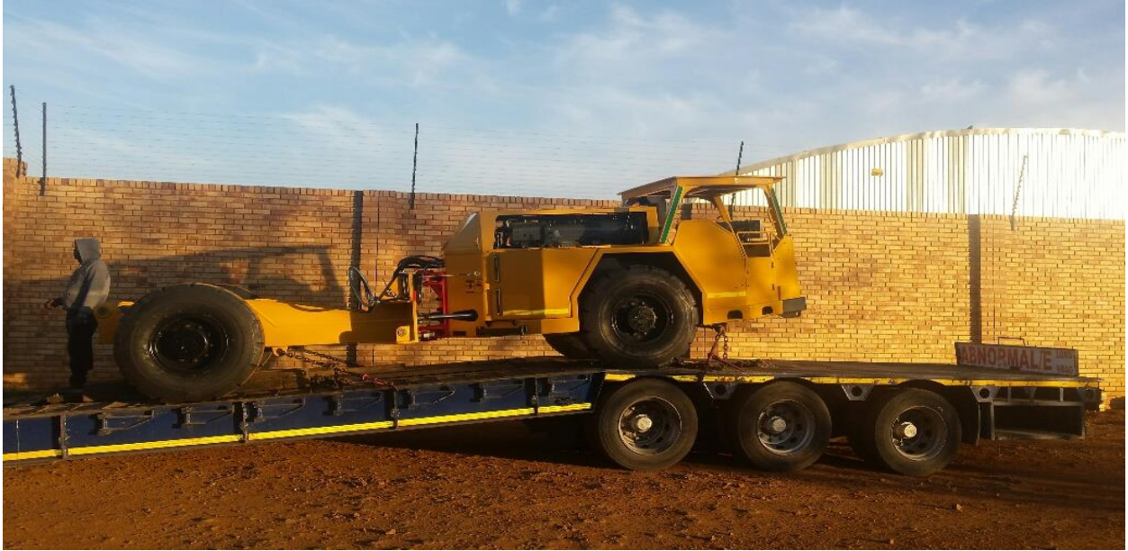
Machine after Rebuild Completed machine been loaded